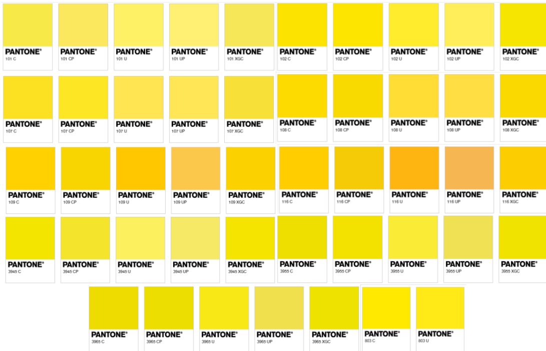
Prohibited Pantone Colour